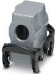
HEAVYCON sleeve housing B10, with double locking latch, height 72 mm, with thread 1x M20, lateral conductor exit

Please be informed that the data shown in this PDF Document is generated from our Online Catalog. Please find the complete data in the user's documentation. Our General Terms of Use for Downloads are valid ( http://phoenixcontact.com/download )