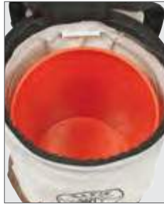
Holds 5 gallon bucket (not included)