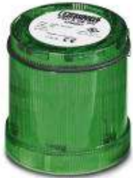
Permanent light element, 12 to 240 V AC/DC, green, without bulb

Please be informed that the data shown in this PDF Document is generated from our Online Catalog. Please find the complete data in the user's documentation. Our General Terms of Use for Downloads are valid ( http://phoenixcontact.com/download )