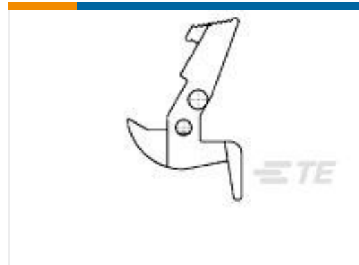
TE Part #102185-1 UNIVERSAL HEADER LATCH