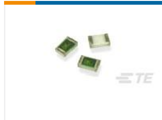
TE Part #7-2176091-0 RP 2A 0.25W 316R 0.1% 25PPM 1K RL