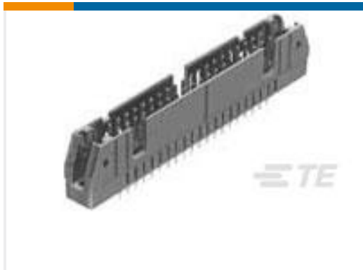
TE Part #1658694-6 A/L UNIV HDR 10P ACT PIN