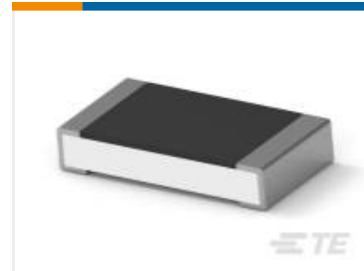
TE Part #1-2176389-4 RQ 1206 147R 0.1% 10PPM 5K RL