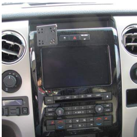
Mount in Place with Mounting Plate in Left Side Down Position on Nav.