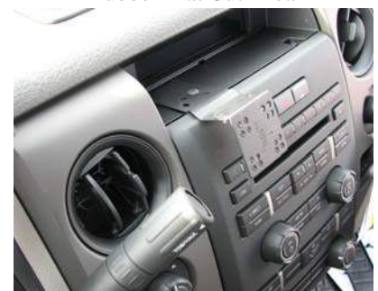
Mount in Place with Mounting Plate in Left Side Down Position