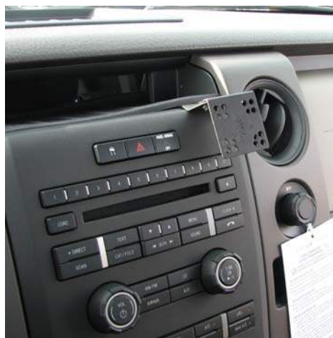
Mount in Place with Mounting Plate in Right Side Down Position