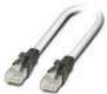
Patch cable, CAT5, assembled, 2 m

Patch cable - FL CAT5 PATCH 2,0 - 2832289