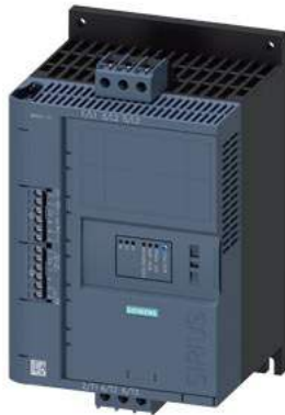
SIRIUS soft starter 200-480 V 32 A, 110-250 V AC Screw terminals Thermistor input