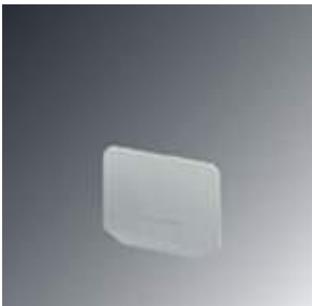
End cover, Width: 2.3 mm, Color: gray

Please be informed that the data shown in this PDF Document is generated from our Online Catalog. Please find the complete data in the user's documentation. Our General Terms of Use for Downloads are valid ( http://phoenixcontact.com/download )