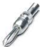
Test plugs, Color: silver