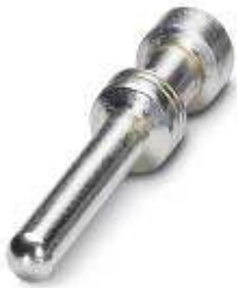
Turned 2.5 crimp contact, individual male contact, switching contact, 2 mm lagging, core diameter 1.00 mm 2 , silver-plated

Please be informed that the data shown in this PDF Document is generated from our Online Catalog. Please find the complete data in the user's documentation. Our General Terms of Use for Downloads are valid ( http://download.phoenixcontact.com )