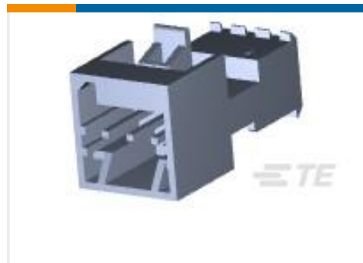
TE Part #647000-3 03P MTA100 PSTD CONN ASSY SN