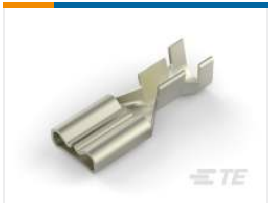
TE Part # 2238198-3 FASTON 187 STD REC STR 20-16TPBR