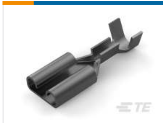
TE Part # 62138-1 187 FASTON REC 24-20 TPBR