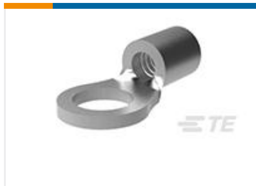
TE Part #2-34113-2 SOLIS R 22-16COMM 22-18MIL 1/4