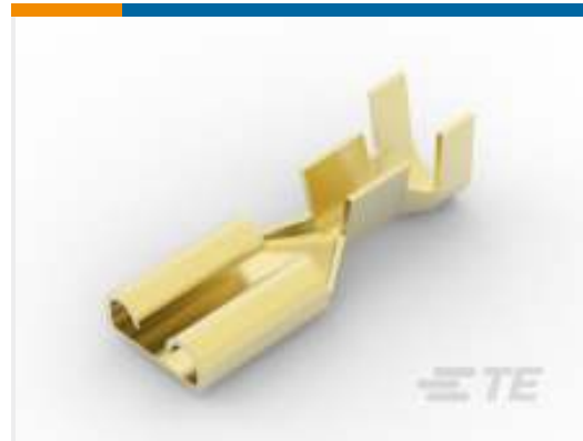
TE Part # 42452-1 187 FASTON REC 20-16 AWG BR