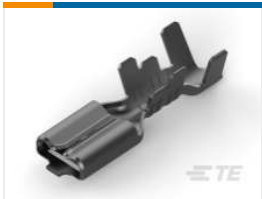
TE Part # 2238174-3 187 FASTON,REC.,24-14 AWG,TPBR