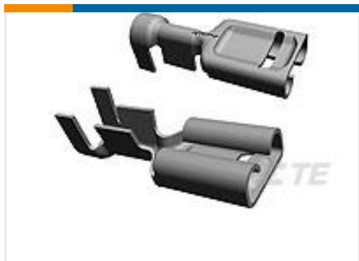
TE Part #61919-1 187 FASTON REC 20-16 AWG BR