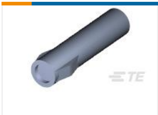
TE Part #770063-1 01P .093 COMM P&S RECPT HSG