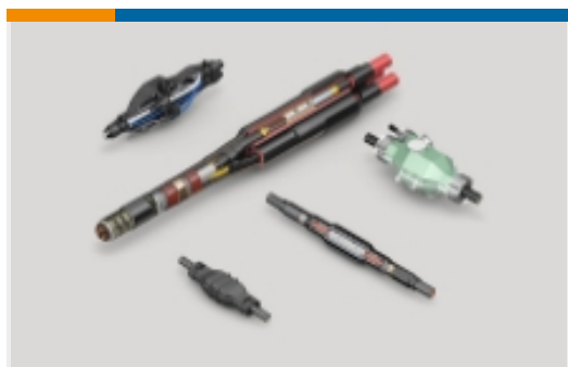
Joints & Splices(1)