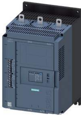
SIRIUS soft starter 200-600 V 171 A, 110-250 V AC Screw terminals Thermistor input