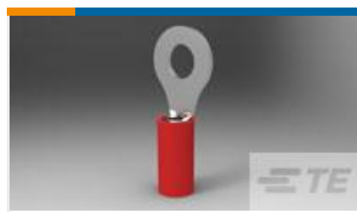
TE Part #320571 PIDG R 22-16 COMM 22-18MIL 1/4