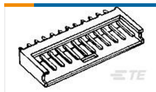
TE Part #280372-2 6P AMPMODU II SHRD HDR, ST, 0.38 AU