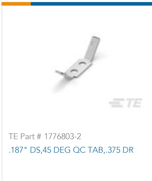
TE Part # 1776803-2 .187" DS,45 DEG QC TAB,.375 DR