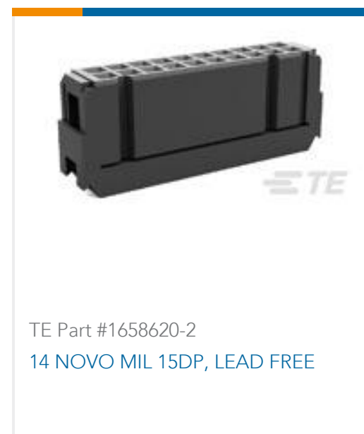
TE Part #1658620-2 14 NOVO MIL 15DP, LEAD FREE