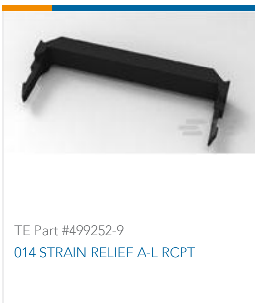
TE Part #499252-9 014 STRAIN RELIEF A-L RCPT