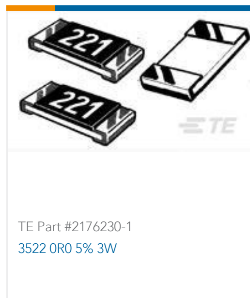
TE Part #2176230-1 3522 0R0 5% 3W