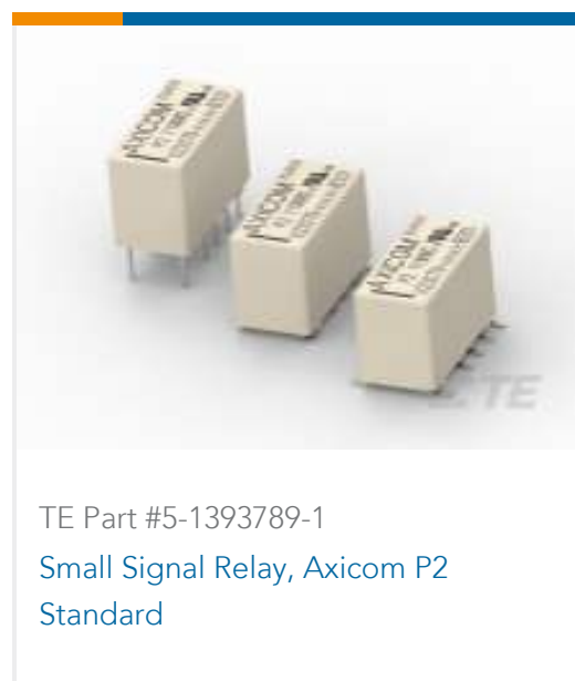
TE Part #5-1393789-1 Small Signal Relay, Axicom P2 Standard