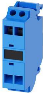
Support terminal, blue, spring-type terminal, for front plate mounting