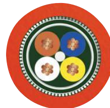
Sercos III [93K]