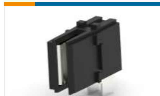
TE Part #2178531-2 CROWN CLIP JUNIOR CONNECTOR