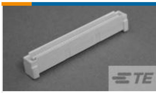
TE Part #6123001-2 0.8FH,P08H.5,060,30/Sn,TR,SC