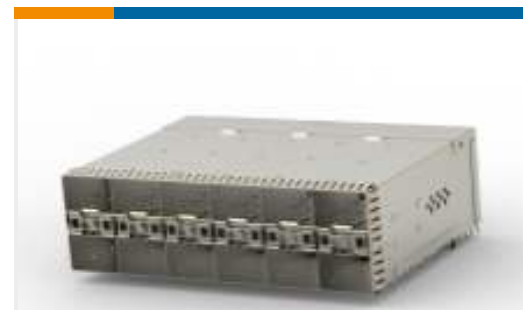
TE Part #2291491-1 ZSFP+ STACKED 2X6 RCPT ASSY, THERMAL