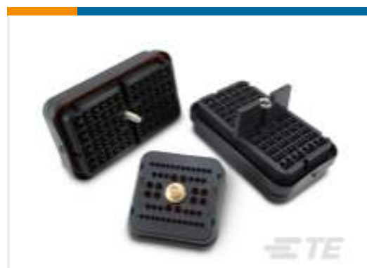
TE Part #DRB16-48SBE-L018 DEUTSCH DRB Housings