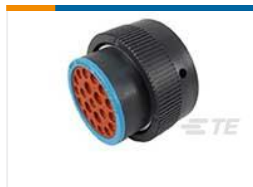
TE Part #HDP26-24-21PE PLG, 21P, BLK, E, 12/16, P