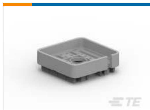
TE Part #WB-48SB DEUTSCH DRB Wedgelocks