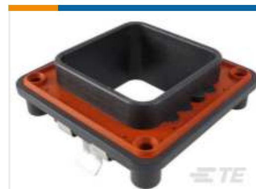
TE Part #DRBF-2B FLANGE, MOUNT, 60/48P, BLK, B