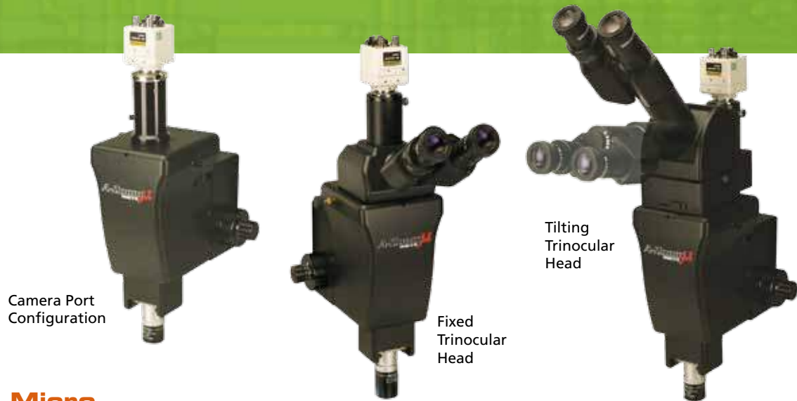
Camera Port Configuration