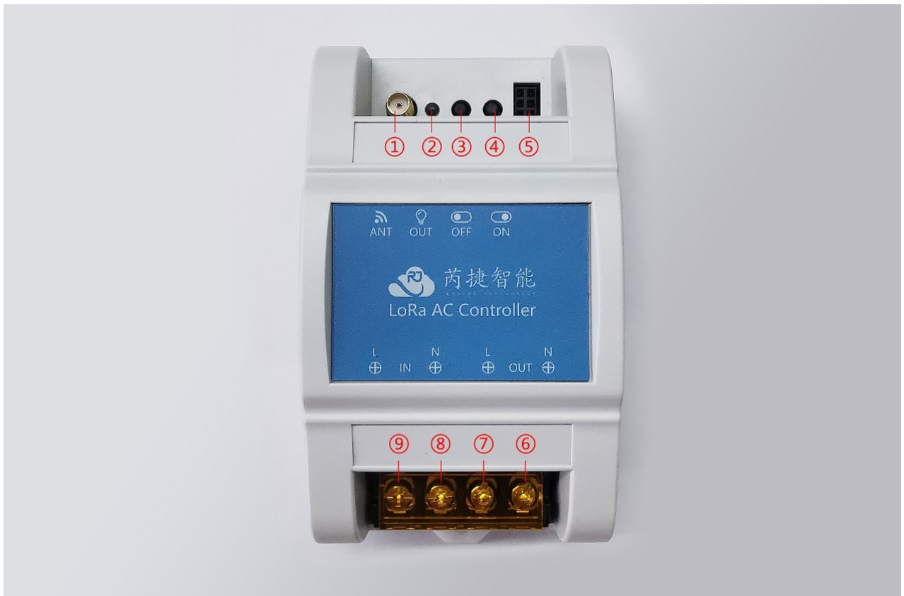
Pic 1-3 Use Example