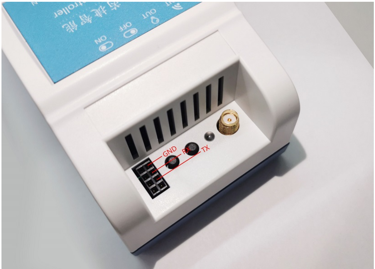
Pic 1-2 Installation