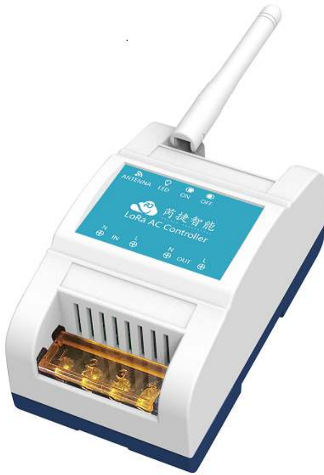
Pic 1-1 Front