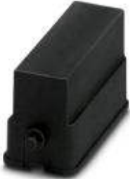
Protective cover for sleeve housing, IP54

Please be informed that the data shown in this PDF Document is generated from our Online Catalog. Please find the complete data in the user's documentation. Our General Terms of Use for Downloads are valid ( http://download.phoenixcontact.com )