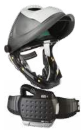
APF 25 L-705 with Adflo