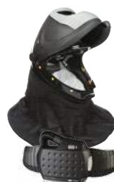
APF 1000 L-905 with Adflo