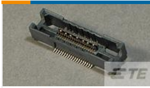
TE Part #5767054-1 MICT, RECPT, 38, ASSY, PDNI