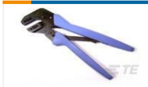
TE Part #90870-1 PROC RMP TL W/DIE COMM .062 P/S