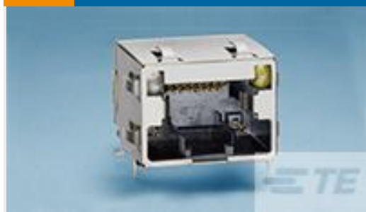
TE Part #2178126-1 Jack, CLOUDSPLITTER SMT SHIELDED