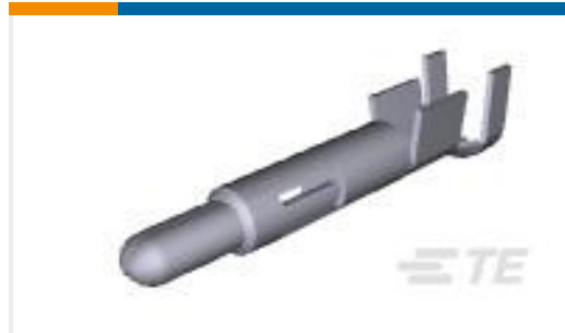
TE Part #926898-3 UNIV. M-N-L. PIN