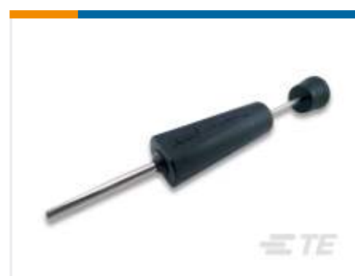
TE Part # 305183 EXTRACT TOOL TYPE 2 20-16