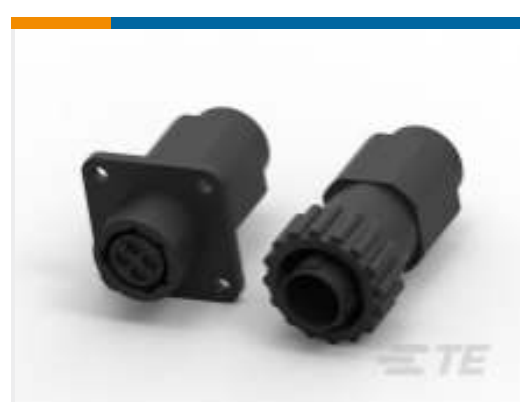
TE Part # CAT-AM71-C83998Y One-Piece Connector, Sealed, CPC Series 1