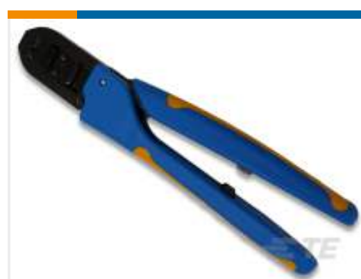
TE Part # 91523-1 CCII TYPE III+ PIN SKT 24-16 ASSY