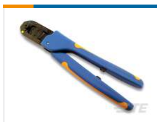
TE Part # 91505-1 CCII TYPE III+ 24-16 ASSY