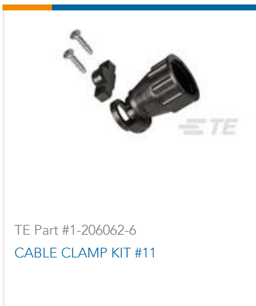
TE Part #1-206062-6 CABLE CLAMP KIT #11