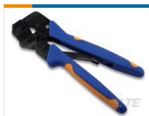
TE Part # 58495-1 PRO CRIMPER ASSY MULTIMATE