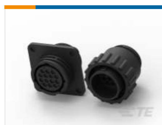
TE Part # CAT-AM71-C83998K Circular Connector, Environmentally Sealed, CPC Series 6