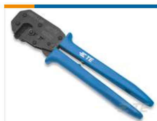
TE Part # 169400 CERTI-LOK FRAME W/O DIES