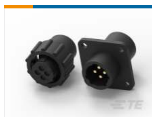
TE Part # CAT-AM71-C83998J Cable/Panel Mount Connector, CPC Series 1