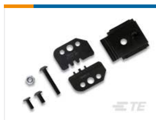
TE Part # 58495-2 PROCRIMPER DIE ASSY MULTIMATE