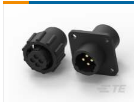
TE Part #211400-1 Cable/Panel Mount Connector, CPC Series 1