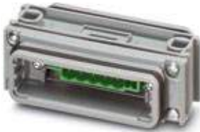
D-SUB coupling, for DeviceNet, shell size 3, header, unshielded, connection direction straight, IP67 degree of protection

Please be informed that the data shown in this PDF Document is generated from our Online Catalog. Please find the complete data in the user's documentation. Our General Terms of Use for Downloads are valid ( http://download.phoenixcontact.com )