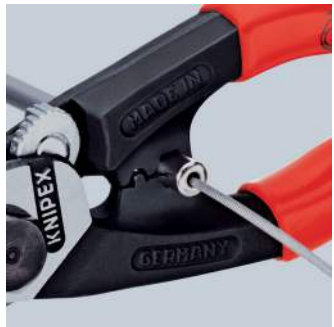
Crimping of the end caps on the Bowden cable sheath