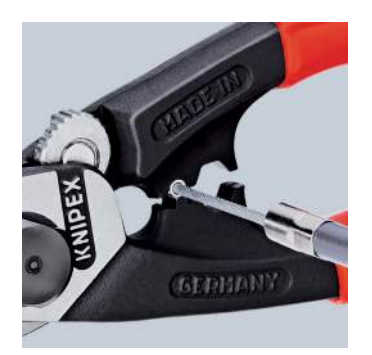
Crimping of the ferrules onto the traction cable