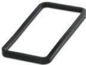
Profile gasket for HEAVYCON EVO supporting base element type B16

Please be informed that the data shown in this PDF Document is generated from our Online Catalog. Please find the complete data in the user's documentation. Our General Terms of Use for Downloads are valid ( http://phoenixcontact.com/download )