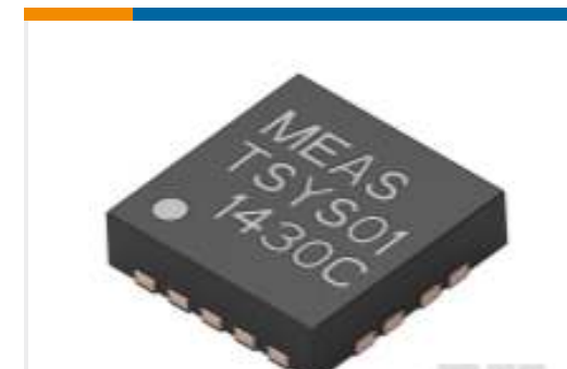
TE Part #G-NICO-018 0.1 DEG C ACCURACY QFN TEMP SENSOR