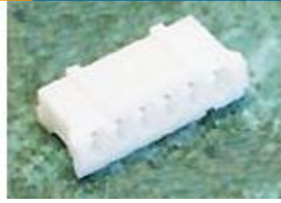
TE Part # 1-440129-5 2.0MM,HSG,15POS