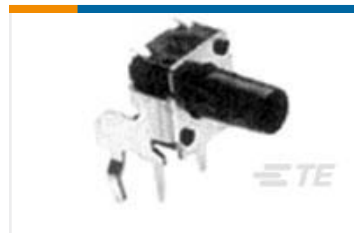
TE Part #1-1825027-7 FSMRA6JH04=R/A, TACT PB SW, 160G