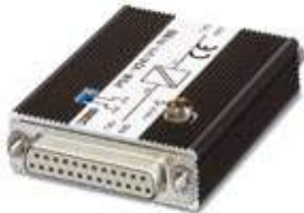
Interface converter, for converting RS-232 (V.24) to RS-422 (V.11), with galvanic isolation

Please be informed that the data shown in this PDF Document is generated from our Online Catalog. Please find the complete data in the user's documentation. Our General Terms of Use for Downloads are valid ( http://phoenixcontact.com/download )