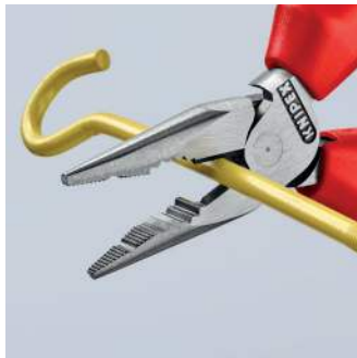
Easy cutting thanks to the high leverage joint