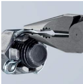
Anti-twist tips remain stable even under high strain