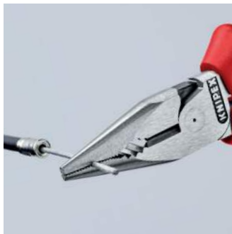
Milled groove in the gripping area

Pliers with integrated tether attachment point for tool drop protection system