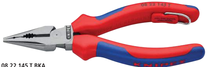
08 22 145 T BKA