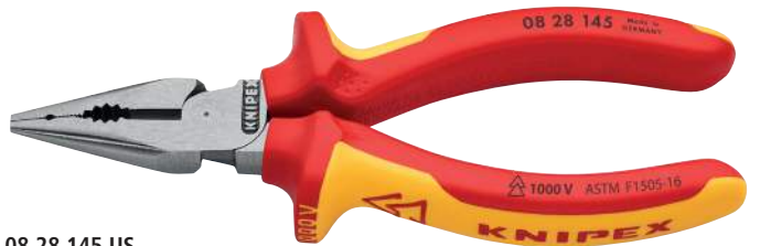
08 28 145 US