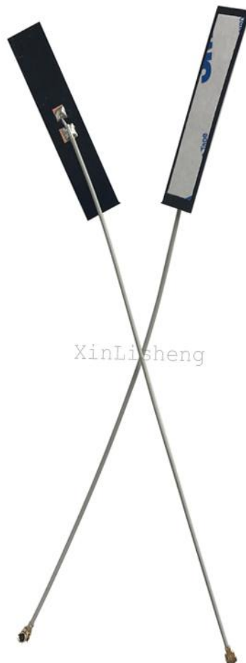
2.4G PCB ANTENNA