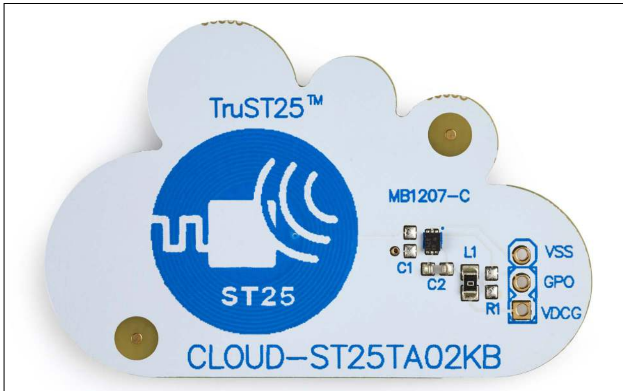
Figure 1. CLOUD-ST25TA02KB board (top view)