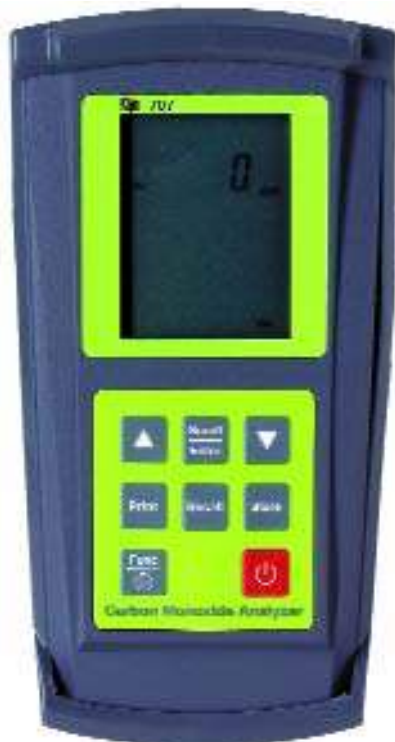
4.0" w X 8.12" h x 2.25" d

Test flue gasses at home or office spaces for the presence and location of CO leaks. With a protective rubber boot, the new 707 fits comfortably in your hand and operates with the push of a button.