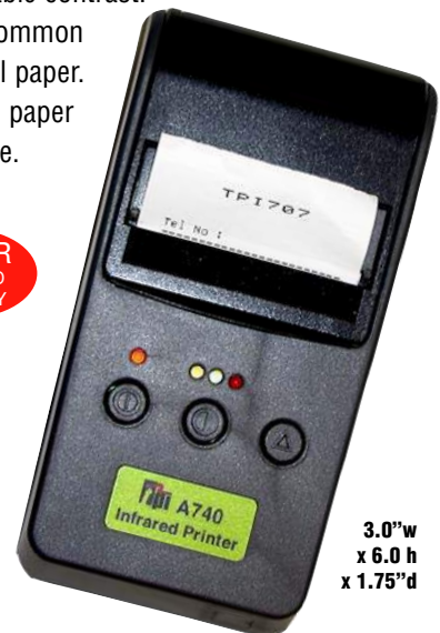
3.0" w x 6.0 h x 1.75" d