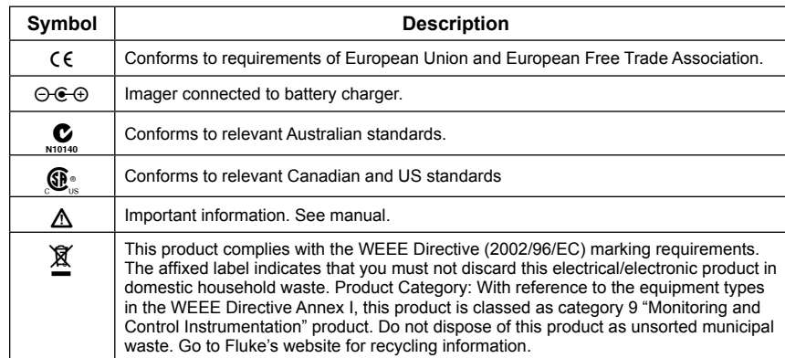
Table 1. Symbols