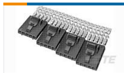
TE Part #103957-3 5X4 MTE RCPT SR LATCH .100CL