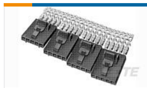
TE Part #103957-9 2X10 MTE RCPT SR LATCH .100CL