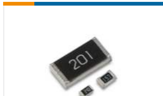
TE Part #2-2176325-1 CRGP 0402 470R 1%