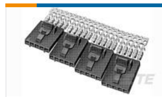
TE Part #5-103959-4 4X5 MTE RCPT SR LATCH .100CL