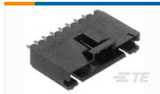
TE Part #103670-5 06 MTE HDR SRST LATCH W/HLDWN