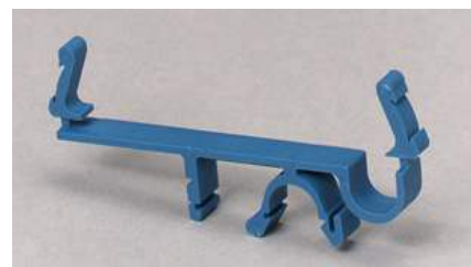
DRB-3 (2 per packet) Phase Relays, ZVM 6000/7000