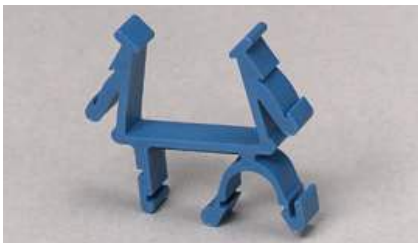
DRB-1 RCS, RDS & SP