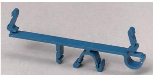
DRB-4 RCD, RCY, CSR & CSRA