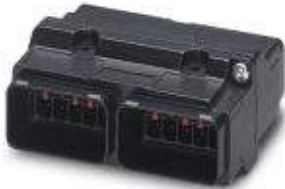
Power H distributor

Power H distributor, 4 x MSTB contact inserts, metal housing, without mounting screws