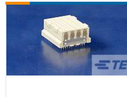
TE Part #1469362-1 HM-ZD VERT RECPT ASSY 18MM