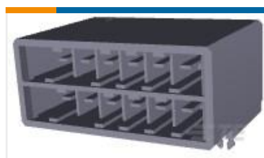
TE Part #1-316081-3 DYNAMIC D-3200 HDR ASSY 12P H