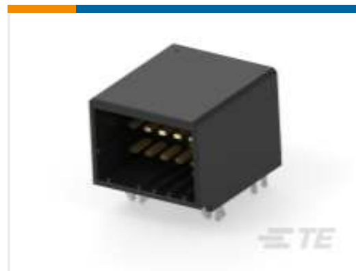
TE Part #1376020-2 Header Assembly: Wire-to-Board, 5A, gold plated