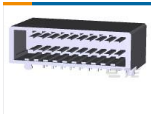
TE Part #178308-3 DYNAMIC D-3 HDR ASSY H 20P