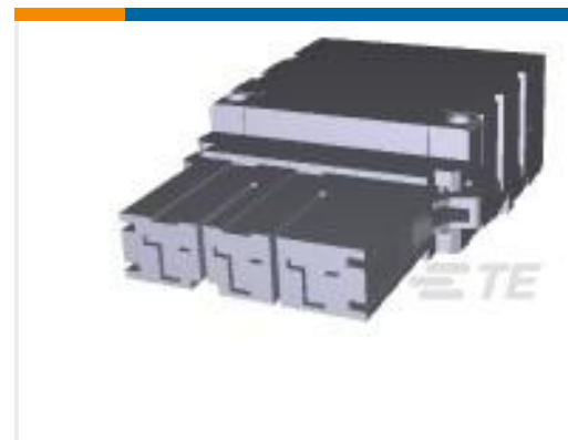
TE Part #1473668-1 KIT D-5 (D-5 DYNA-CLAMP 3P)