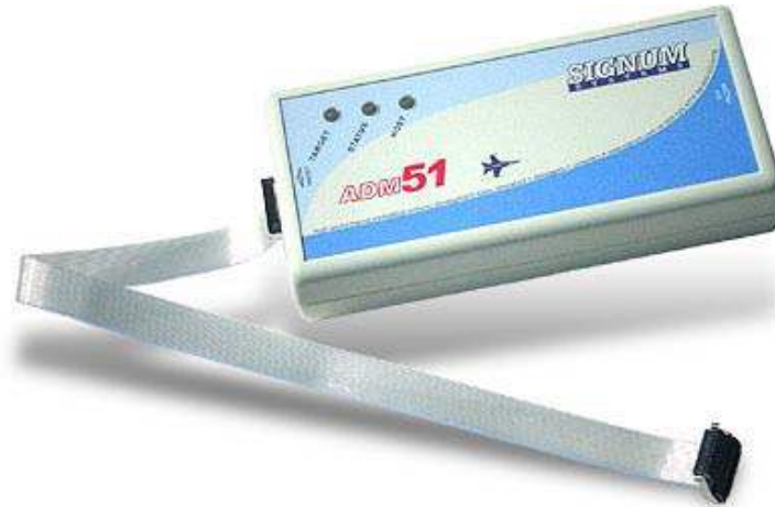
Figure 2: Signum ADM51 Emulator Pod

Note: Since meters are sometimes tested with live voltages, isolation of the emulator is strongly recommended. USB isolators are available from various vendors. For example, the UISOHUB4 or UEF10M are available at B&B Electronics ( www.bb-elec.com , or http://www.bb-europe.com/ ).