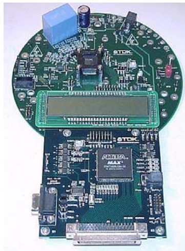
Figure 5: 71M6513 Demo Board with Debug Board

After the evaluation phase, the Demo Board can serve as a platform for code development, which can be done simultaneously with schematic design and layout.