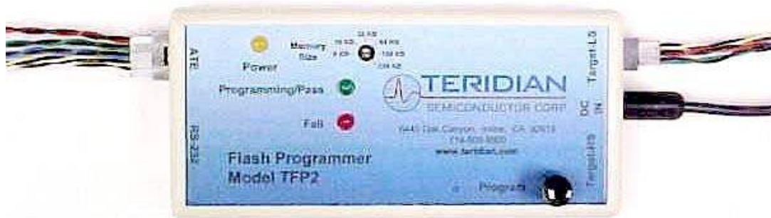
Figure 4: Teridian TFP-2 Flash Programmer

The Signum ADM51 can serve as a programmer for prototyping and small quantities. For programming production quantities, Teridian offers the TFP2 Flash Programming Module (P/N 80515-FPBM-TFP2), which is a stand-alone programmer that can be operated manually or in an ATE environment (see Figure 4).