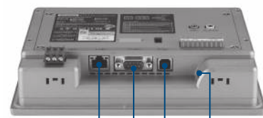
Ethernet COM1 (RS-232/422/485) USB Client Micro SD Slot