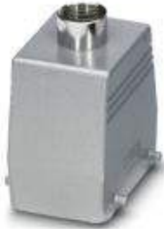
HEAVYCON sleeve housing D50, for double locking latch, height 76 mm, with support 1xM25, straight conductor exit

Please be informed that the data shown in this PDF Document is generated from our Online Catalog. Please find the complete data in the user's documentation. Our General Terms of Use for Downloads are valid ( http://download.phoenixcontact.com )