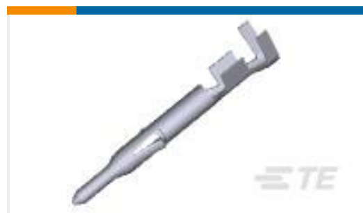
TE Part #770985-3 MINI UMNL PIN 26-22AWG AU LP