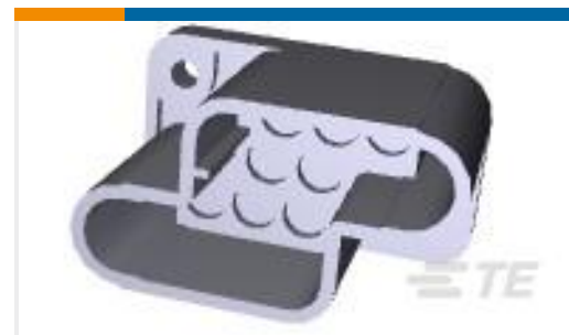
TE Part #213500-1 RECPT HSG,8 POWER,METRIMATE