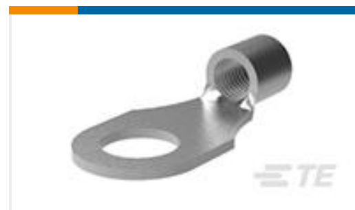
TE Part #321271 TERMINAL,SOLIS R 4/0 5/16