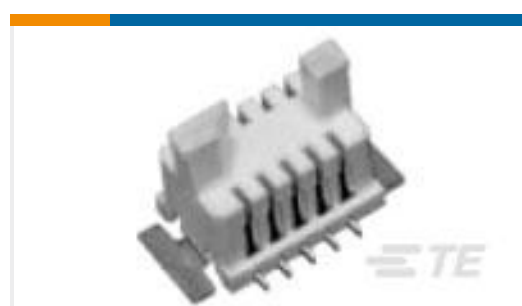
TE Part #1-1375870-4 RCPT ASSY,32 POS,VERT,0.8MM MI