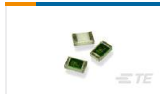
TE Part #6-1879215-0 CPF 0402 18K7 0.1% 25PPM 1K RL