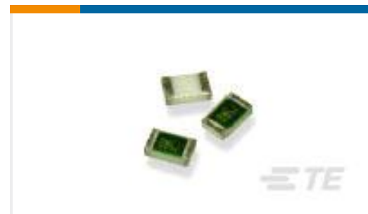
TE Part #3-1879215-5 CPF 0402 9K31 0.1% 25PPM 1K RL