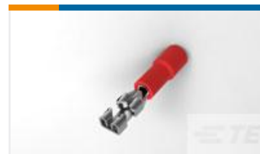
TE Part #640923-2 RECEPT,PIDG, FASTON, .110 SERIES, 22-18