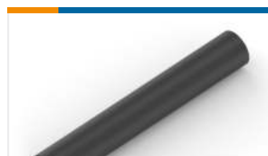
TE Part #NB25942001 SCL-1-0-STK