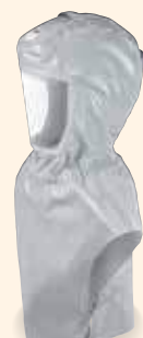
3M™ Versaflo™ Hood Assembly S-855

Similar to S-657 but with a fabric specifically intended to help capture paint overspray, minimizing the potential for paint to flake off the wearer and onto the work piece. Fabric has an internal film barrier to help prevent paint contact with skin or clothes.