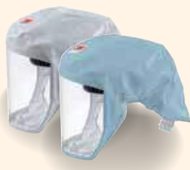
3M™ Versaflo™ Headcover S-133 and S-133B Head and face coverage. Integrated Comfort suspension. General purpose fabric.