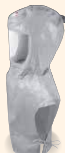
3M™ Versaflo™ Hood Assembly S-857

Similar to S-655 but made with Kappler® Zytron® 200, a polypropylene fabric with a multi-layer barrier film. Features sealed seams, making it suitable for environments where certain liquid splash hazards may be present. Includes a comfortable inner collar.