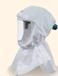
3M™ Versaflo™ Hood Assembly S-655

Head, face, neck and shoulder coverage. Its respiratory seal is a comfortable, knitted inner collar that is shorter and thinner than previous models. General purpose, cost-effective fabric.