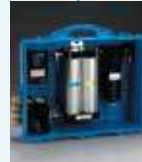
256-02-01 (100 cfm) with CO Monitor 256-02-00 (50 cfm) with CO Filtration and Monitor