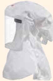
3M™ Versaflo™ Headcover S-433 Head, face, neck and shoulder coverage. Integrated suspension.