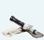
V-100/37018 Vortex Cooling Assembly