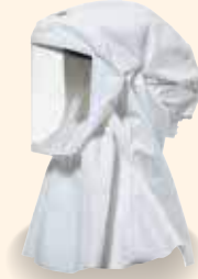
3M™ Versaflo™ Hood S-533 Head, face, neck, and shoulder coverage. Comfort suspension. Durable, soft, quiet, low-linting fabric that drapes more comfortably over the wearer.