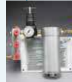
W-2806/07006 (50 cfm) without CO Monitor

IMPORTANT: These filter and regulated panel products do not produce Grade-D breathing air. The employer is required to ensure that the compressed air used with any supplied air system meets the requirements for Grade-D breathing air per the Compressed Gas Association Commodity Specification G-7.1-1997. In Canada, refer to CSA Standard Z180.1 for the quality of compressed breathing air.