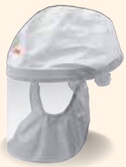
3M™ Versaflo™ Economy Headcover S-103 Head and face coverage. Fabric suspension.