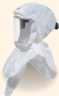
3M™ Versaflo™ Hood Assembly S-657

Head, face, neck and shoulder coverage. Its respiratory seal is a comfortable, knitted inner collar that is shorter and thinner than previous models. General purpose, cost-effective fabric.