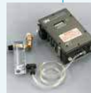
W-2808/37027 CO Monitor Retrofit Kit

IMPORTANT: These filter and regulated panel products do not produce Grade-D breathing air. The employer is required to ensure that the compressed air used with any supplied air system meets the requirements for Grade-D breathing air per the Compressed Gas Association Commodity Specification G-7.1-1997. In Canada, refer to CSA Standard Z180.1 for the quality of compressed breathing air.