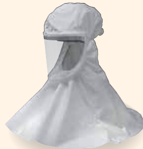
3M™ Versaflo™ Economy Hood S-403 Head, face, neck, and shoulder coverage. Fabric suspension, inner shroud.