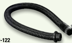
GVP-122 Breathing Tube