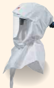
3M™ Versaflo™ Hood Assembly S-757 / 37301

Similar to S-655. The S-657 uses a double shroud design for its respiratory seal; wearers can select their preferred seal design. The S-657 is worn by tucking the inner shroud into a shirt or protective coverall, allowing excess air to be channeled over the body.