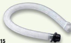
H-115 Breathing Tube