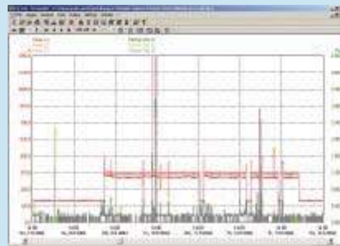
For root cause analysis, different measurements such as flicker, voltage and THD can be shown in the same time plot, helping to quickly identify the cause of a disturbance.

With its easy-to-use interface, the included PQ Log software assists you with logger setup, enables you to verify actual measurement values quickly using the online function, and downloads data from the logger to a connected PC operating on standard Windows® operating systems. You can view the logged data in graphical and tabular form, export it to a spreadsheet, or generate a professional report with the Report Writer function.