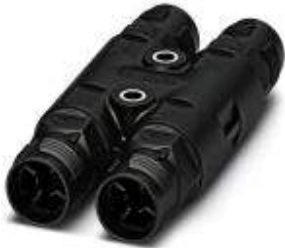
H distributor, QUICKON connection, No. of pos.: 3+PE, 0.5 mm 2 ... 1.5 mm 2 , 690 V, 17.5 A, black

Please be informed that the data shown in this PDF Document is generated from our Online Catalog. Please find the complete data in the user's documentation. Our General Terms of Use for Downloads are valid ( http://phoenixcontact.com/download )