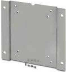
Mounting plate for FL SWITCH 30... and FL SWITCH 40... 16-port switches

Please be informed that the data shown in this PDF Document is generated from our Online Catalog. Please find the complete data in the user's documentation. Our General Terms of Use for Downloads are valid ( http://phoenixcontact.com/download )