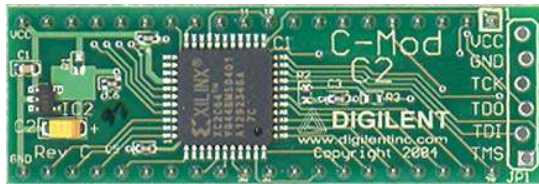
The Cmod board.

Cmod boards combine a Xilinx CPLD, a JTAG programming port, and power supply circuits in a convenient 600-mil, 40-pin DIP package. Cmods are ideally suited for breadboard or other prototype circuit designs where the use of small surface mount packages is impractical. All Cmod boards include: