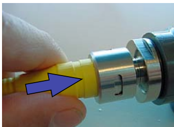
1. Push-to-mate connector