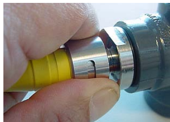
2. Integral isolating ring does not allow pull-to-disconnect