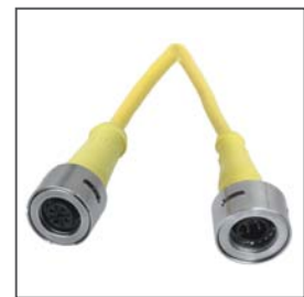
Brad® Ultra-Lock® (M12) EX Connection System for Zone 2 Hazardous Locations

Left: Female Single Ended (Series 120614)