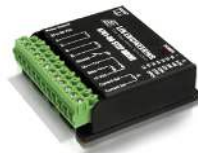
Microstepping Driver R701P-RO