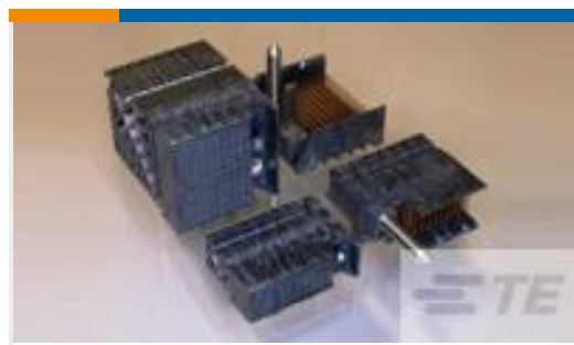
TE Part #2007804-2 IMP100S,H,V3P16C,UG,OEW39,4.9