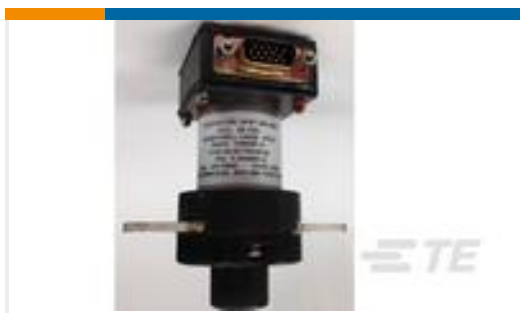
TE Part #1616068-9 K300B5C5=CONTACTOR 300 AMP SPST NO DB