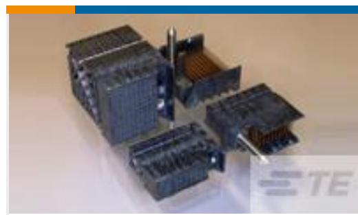
TE Part #2149976-2 IMP100S,H,V4P6C,UG,DEW39,4.9