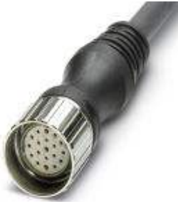
Socket M23, straight, 19-pos., with 20 m master cable

Please be informed that the data shown in this PDF Document is generated from our Online Catalog. Please find the complete data in the user's documentation. Our General Terms of Use for Downloads are valid ( http://download.phoenixcontact.com )